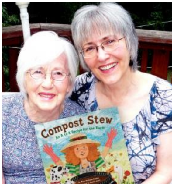
The author with her mother / compost instigator.

Clever mom, for if I was too lazy to start a compost heap, I would naturally also be too lazy to dismantle one, and sure enough, by the time she went home a couple of weeks later, our humble heap was well on its way and virtually maintaining itself. With the kids cheerfully adding kitchen scraps and my husband dutifully contributing yard waste, I realized that Mother Nature would do the rest of the work... letting me off scot-free! I was hooked.